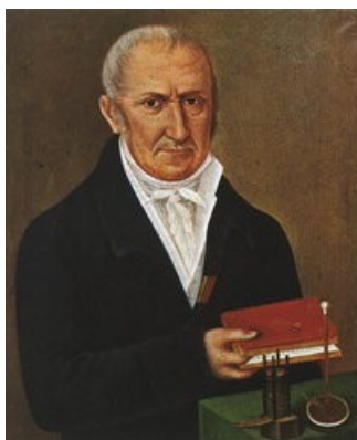
Illustration 1: Alessandro Volta

The work of Galvani (and other scientists after him) in "animal electric fluid" was partially the inspiration for Mary Shelley's book "The Modern Prometheus", better known simply as "Frankenstein." You can read the book by clicking here or here .