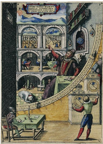
Illustration 2: Brahe and assistants at Uraniborg.

Brahe spent the next twenty years at Uraniborg making observations that were more precise and detailed than any that had ever been done before.