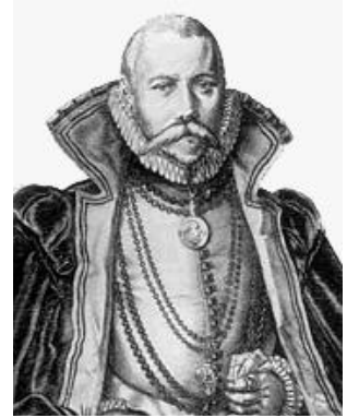
Illustration 1: Tycho Brahe